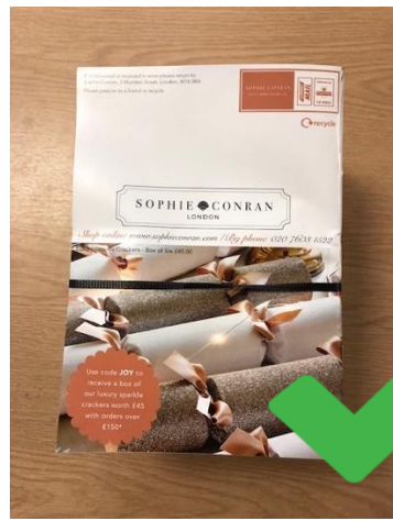
SINGLE STRAP Single strap if required